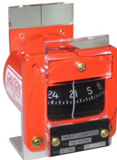
Figure 4 Sight Compass