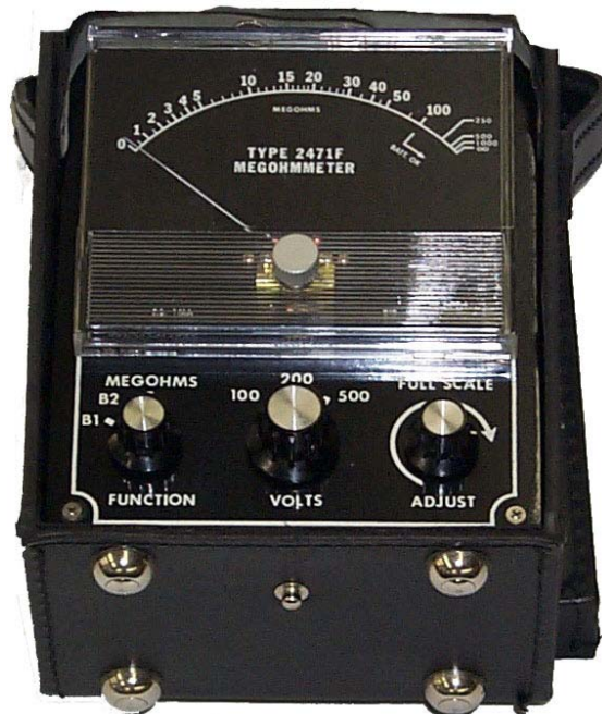
Figure 4: General View of the Megohmmeter 2471F